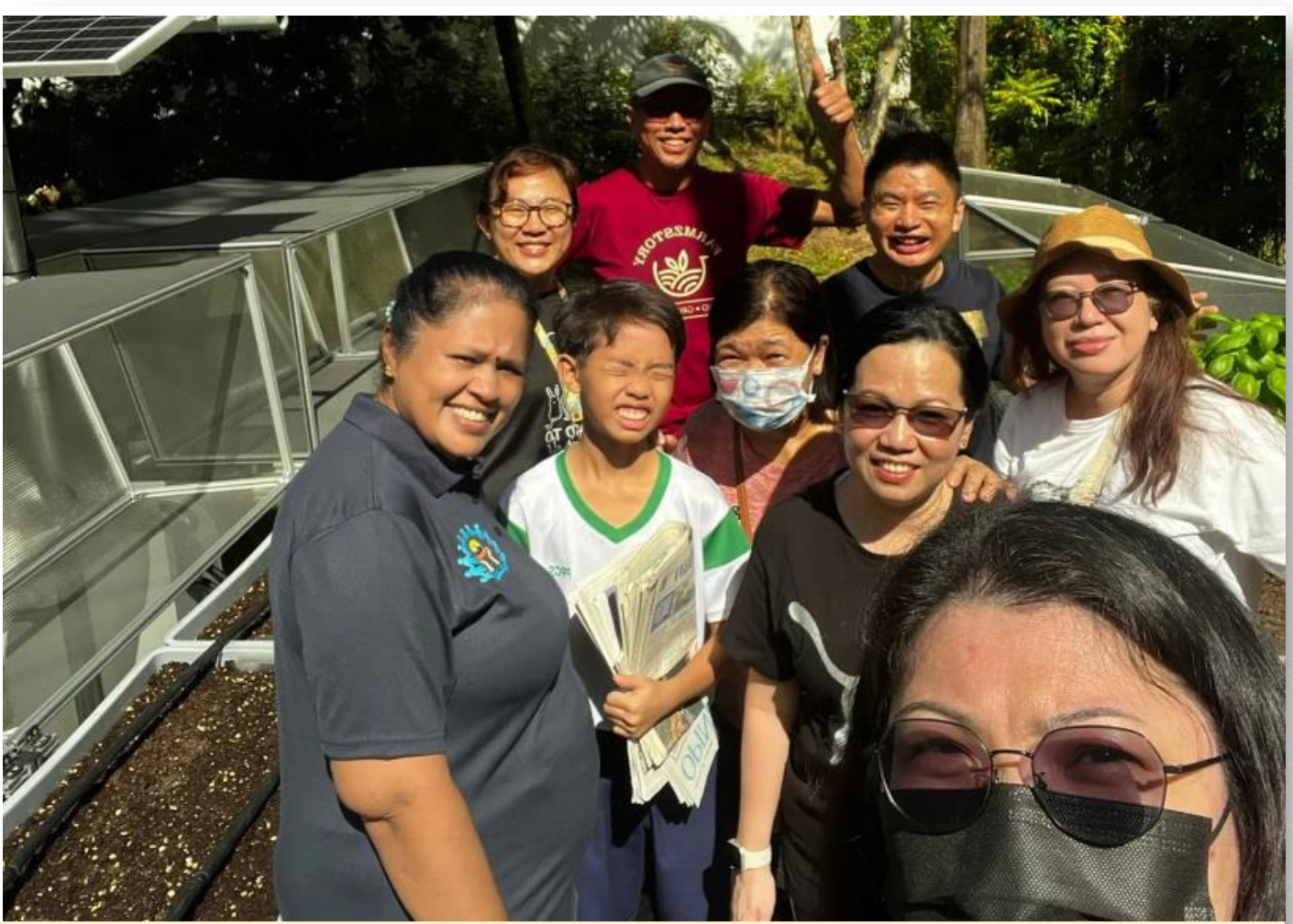
Green fingers unite! A special urban farming workshop, with fresh delicious harvest!