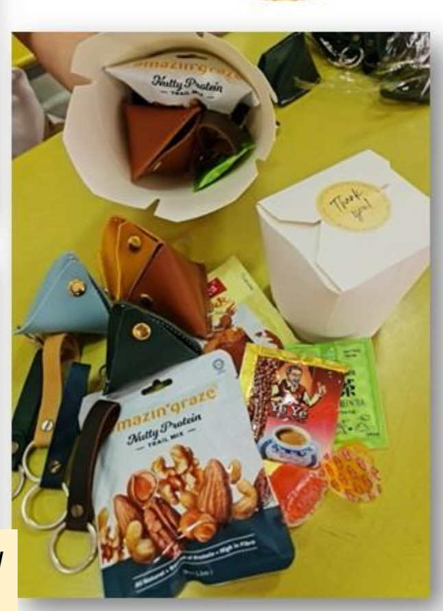
Packing of Teachers' Day gifts and sending our appreciation and love to our Educators and Staff!